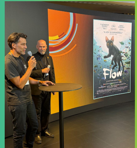
Open-Source takes center stage