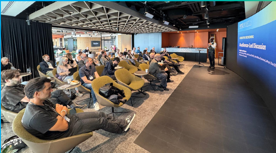
High-impact exchange in a private executive setting

Two continents, one conversation. For those who see disruption, AI, and real-time as fuel — not fear