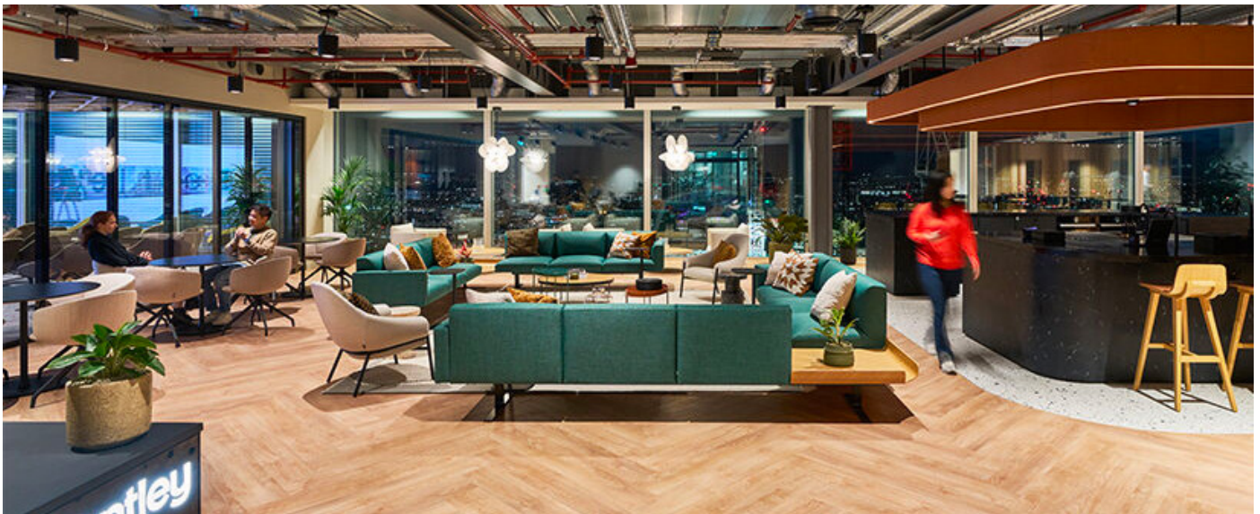
Perfect for execs flying high — Bentley Systems' HQ offers a premium space for networking and collaboration.

Social media platforms: LinkedIn, Twitter, Facebook Newsletters are sent to the RTC opted-in email subscriber list.