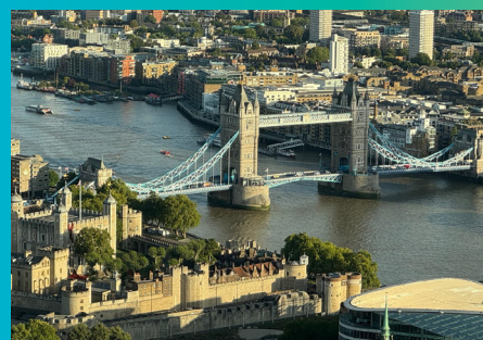
RESET London: breathtaking views across the Thames