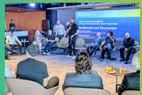
RESET removes the stage — the circle moves us forward.